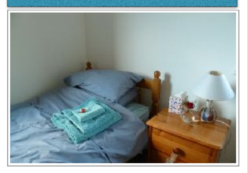
Room 1 has a single bed plus a comfortable fold down bed to make it into a twin room if preferred.